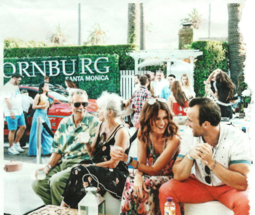
Guests relaxing in the Hornburg Jaguar Land Rover lounge