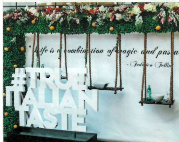
IACCW's #TrueItalianTaste photo wall