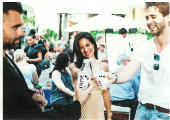
Guests enjoying Hint water