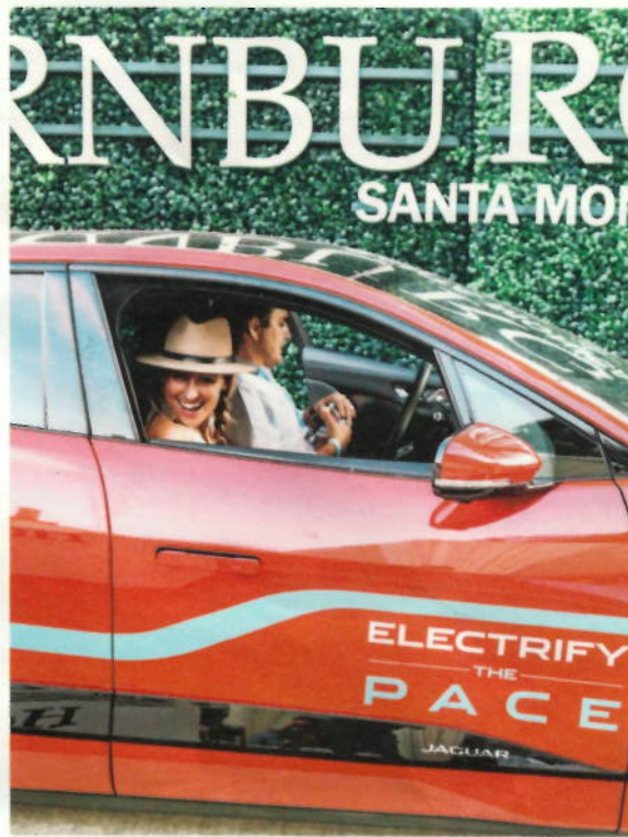
Guests testing out the latest Jaguar I-Pace