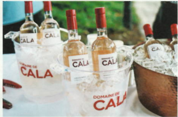
Domaine de Cala was the featured rosé