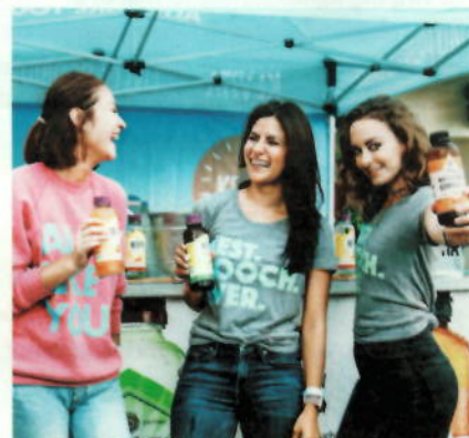
KeVita served up their kombucha along with a healthful chef pairing