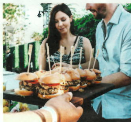
BOA Steakhouse's Impossible Burger